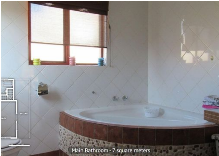
Main Bathroom - 7 square meters