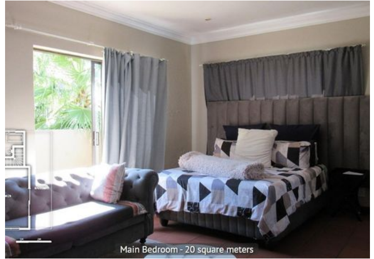
Main Bedroom - 20 square meters