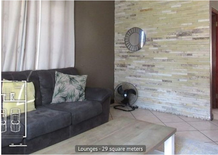
Lounges - 29 square meters